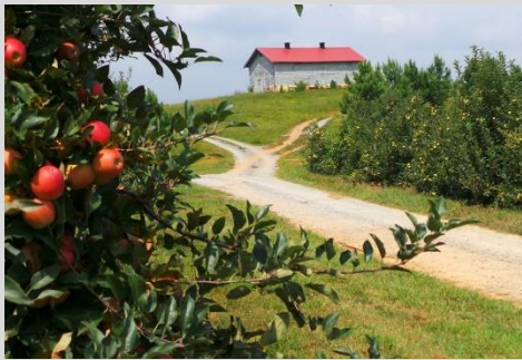
Picture of an apple orchard in Gilmer County